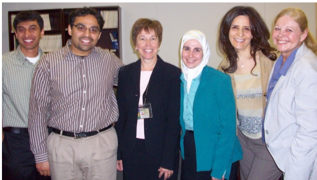
Representatives from the MPH Program at Wayne State University

Georgia Southern University Jiann-Ping Hsu College of Public Health Initial accreditation conferred to July 1, 2016