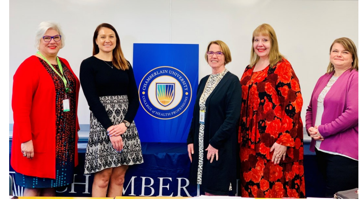
CEPH staff at consultation visits with University of Hong Kong PHP (top) and Chamberlain University PHP.